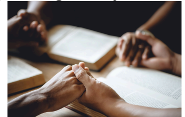
Shared from the ACGC website